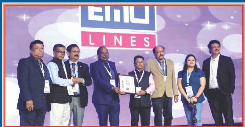
EMU LINES PVT. LTD.