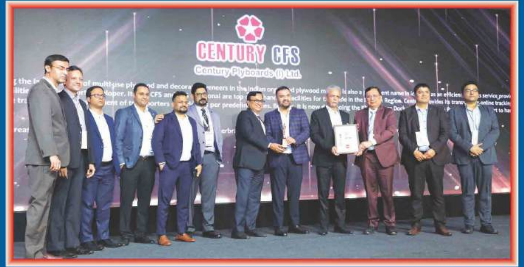
CENTURY PLYBOARDS (I) LTD.