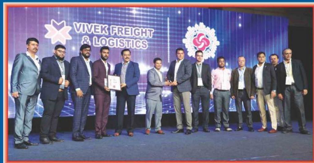
(On basis of Volume) - SPEEDWAYS LOGISTICS PVT. LTD.