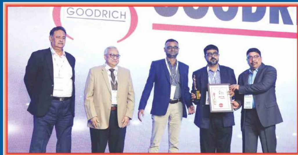
GOODRICH MARITIME PRIVATE LIMITED