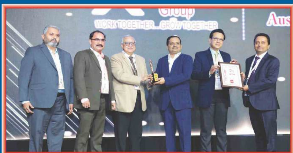
(On basis of Volume) - EXPRESSWAY CARGO MOVERS PVT. LTD.