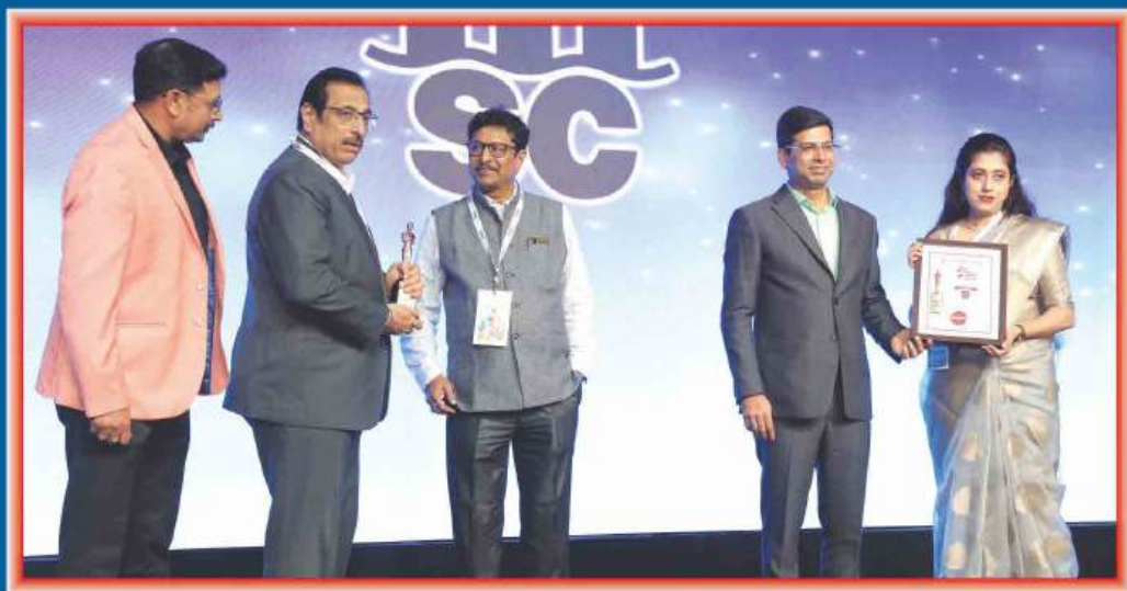
MEDITERRANEAN SHIPPING COMPANY