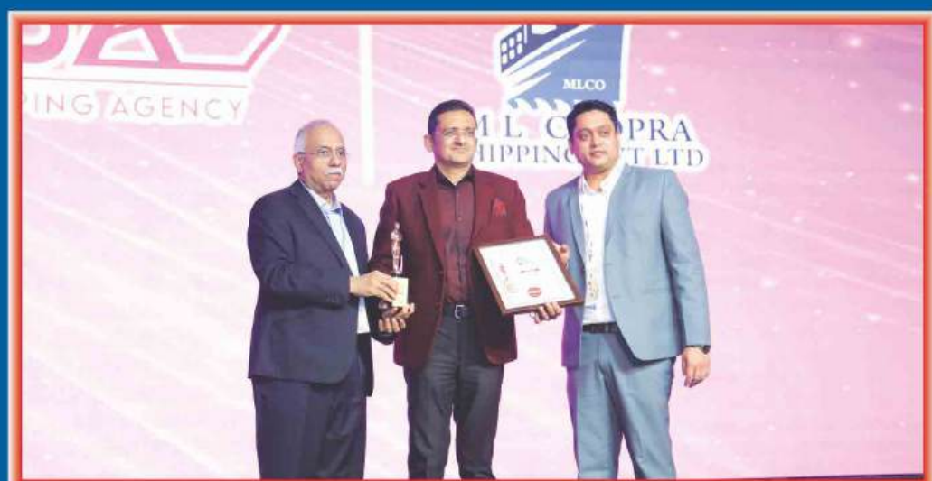
JAIN SHIPPING AGENCY