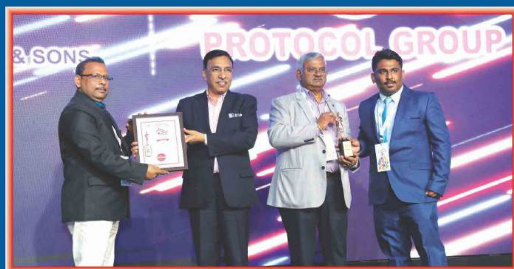
TRANS LOG-SHIP PVT. LTD.