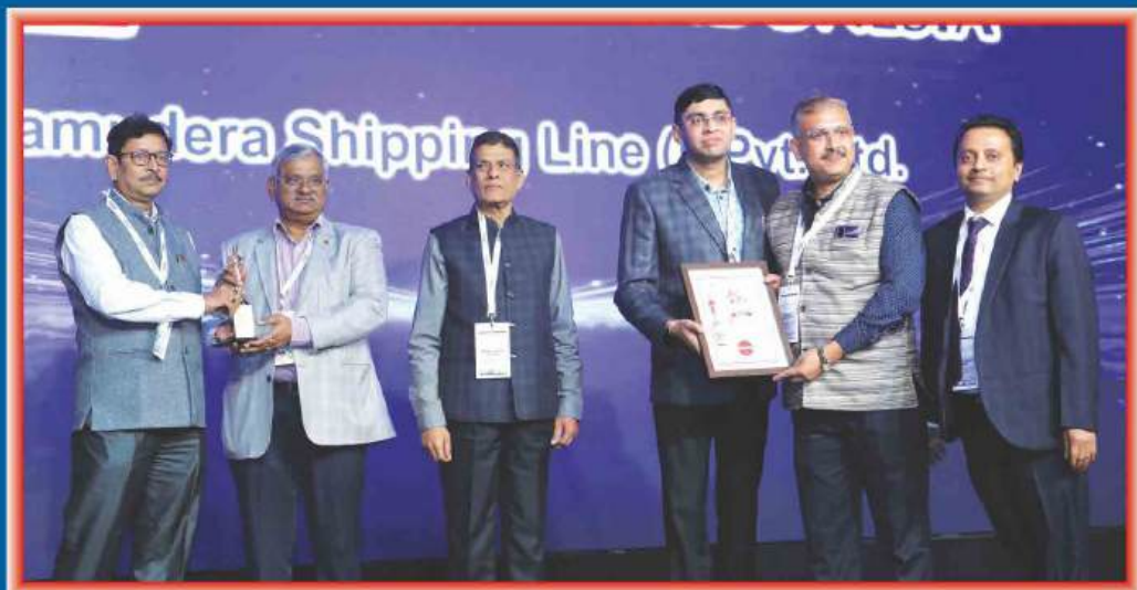
SAMUDERA SHIPPING LINE (I) PVT. LTD.