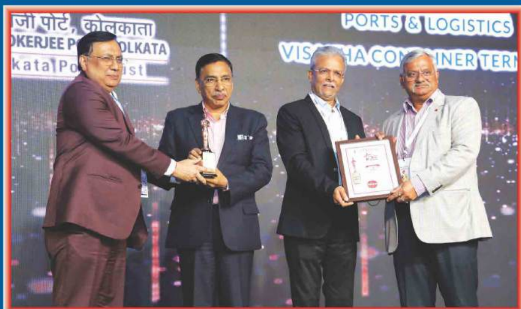
SYAMA PRASAD MOOKERJEE PORT (FORMERLY KOLKATA PORT TRUST)