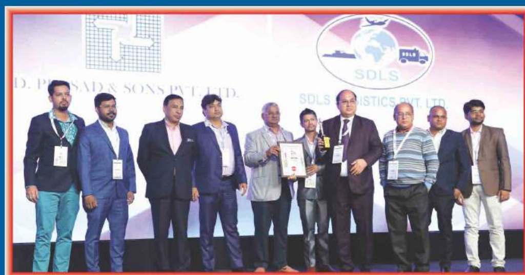
(On basis of Growth) - SDLS LOGISTICS PVT. LTD.