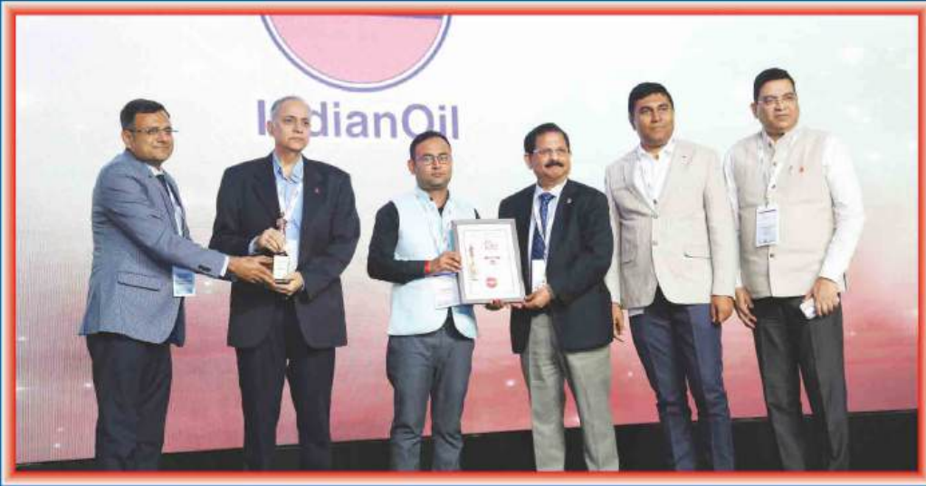
INDIAN OIL CORPORATION LIMITED