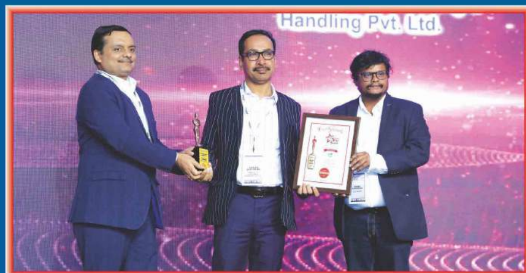
RIPLEY & CO. STEVEDORING & HANDLING PVT. LTD.