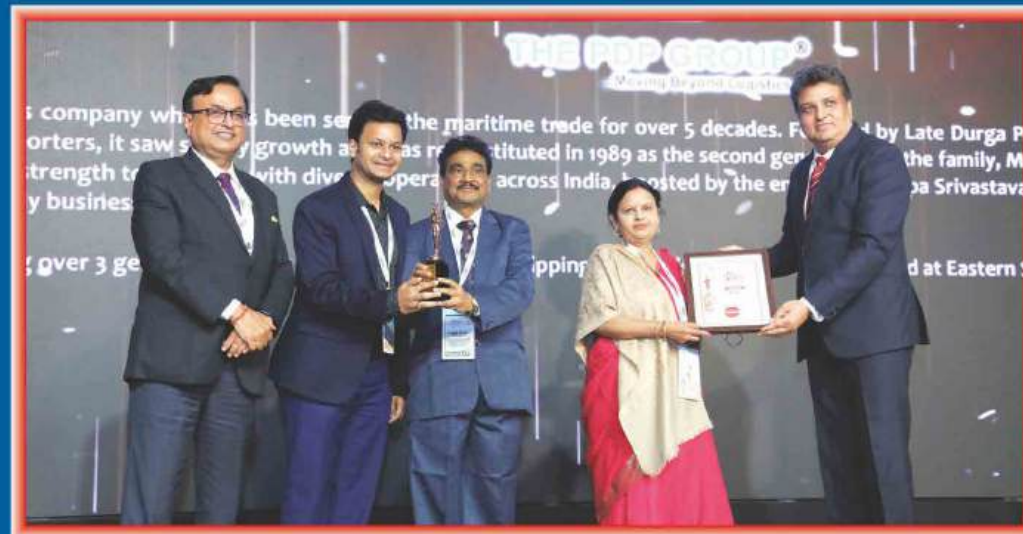
THE PDP GROUP