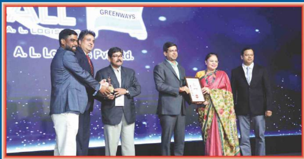
A. L. LOGISTICS PVT. LTD.