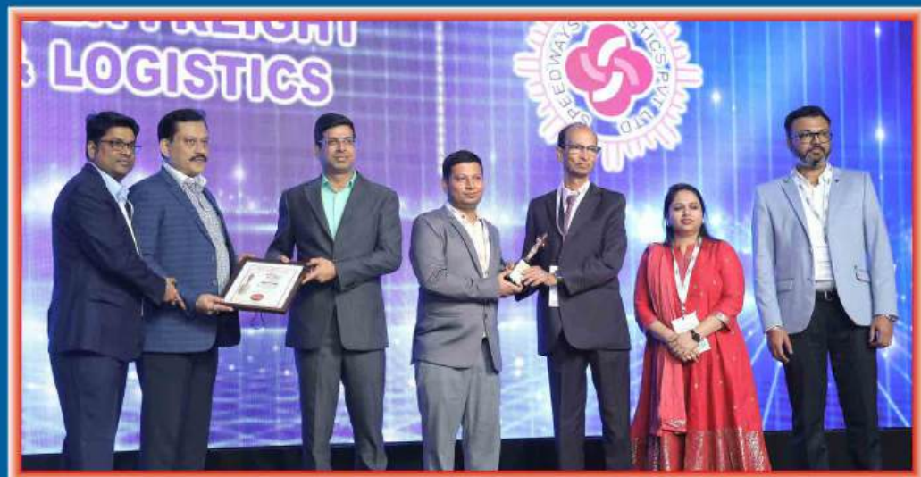
(On basis of Growth) - VIVEK FREIGHT & LOGISTICS PVT. LTD.