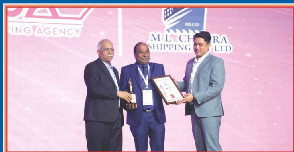
M. L. CHOPRA SHIPPING PVT. LTD.