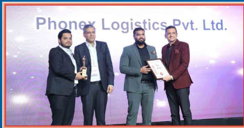
PHONEX LOGISTICS PVT. LTD.