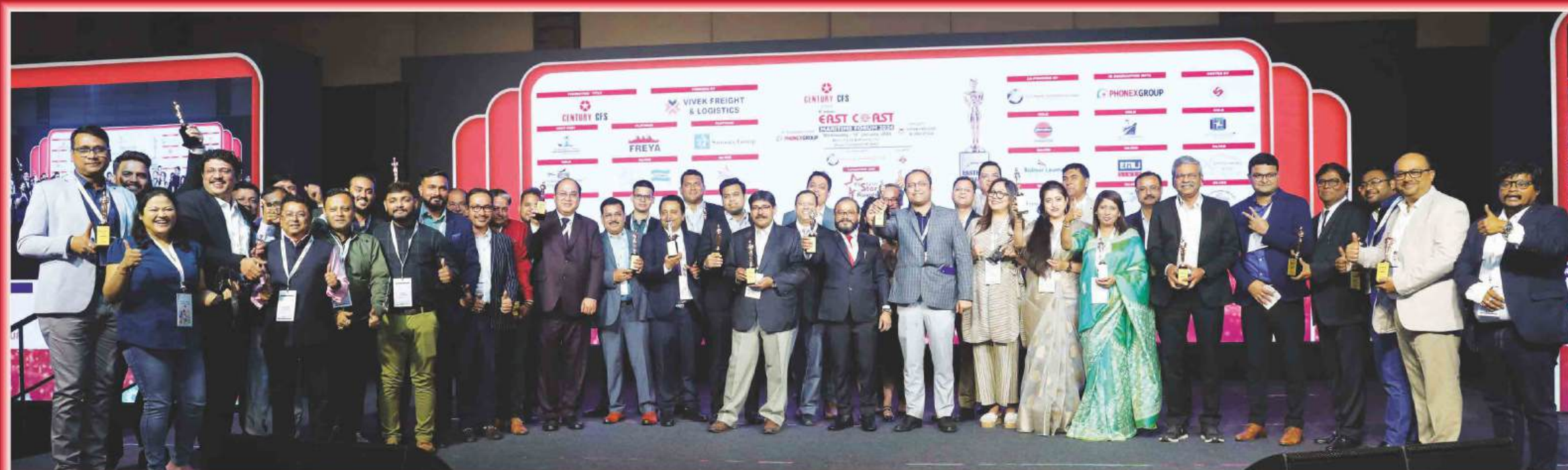
Some of the award winners

As the event concluded with networking cocktails and dinner, attendees expressed happiness at the quality of the deliberation, the deserving awards, and the opportunity to catch up with all in the trade gathered under one roof.