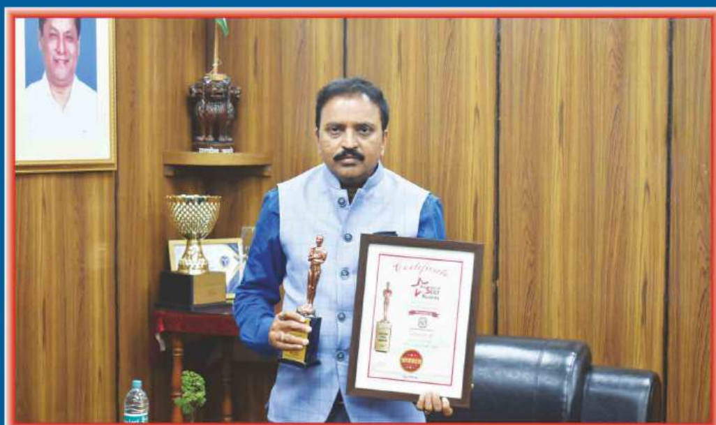
PARADIP PORT AUTHORITY