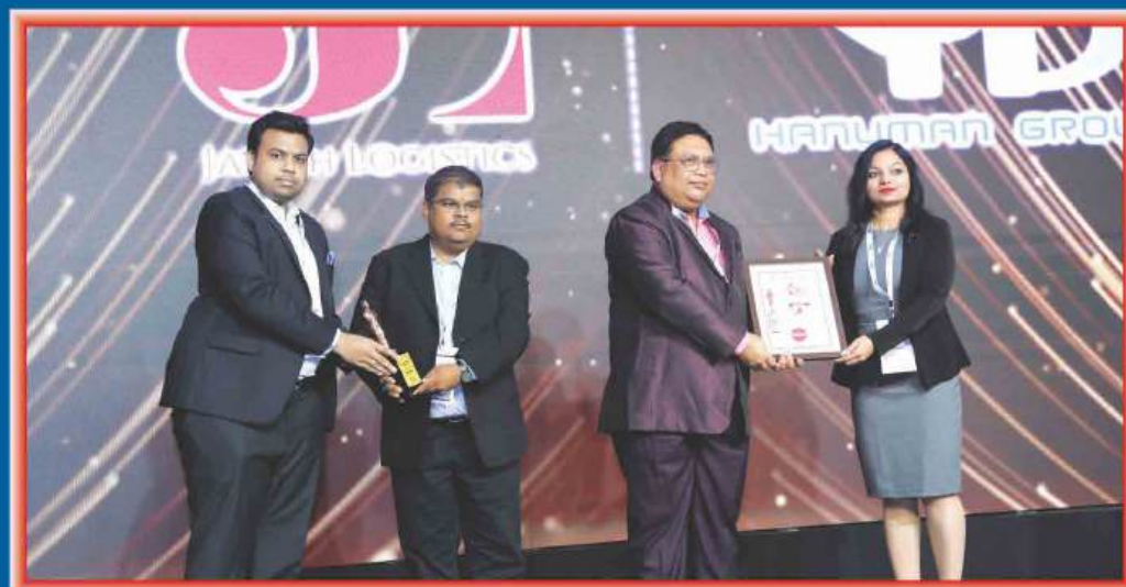
JAYESH LOGISTICS PVT. LTD.