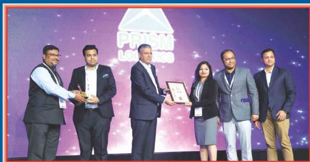
PRISM LOGISTICS PVT. LTD.