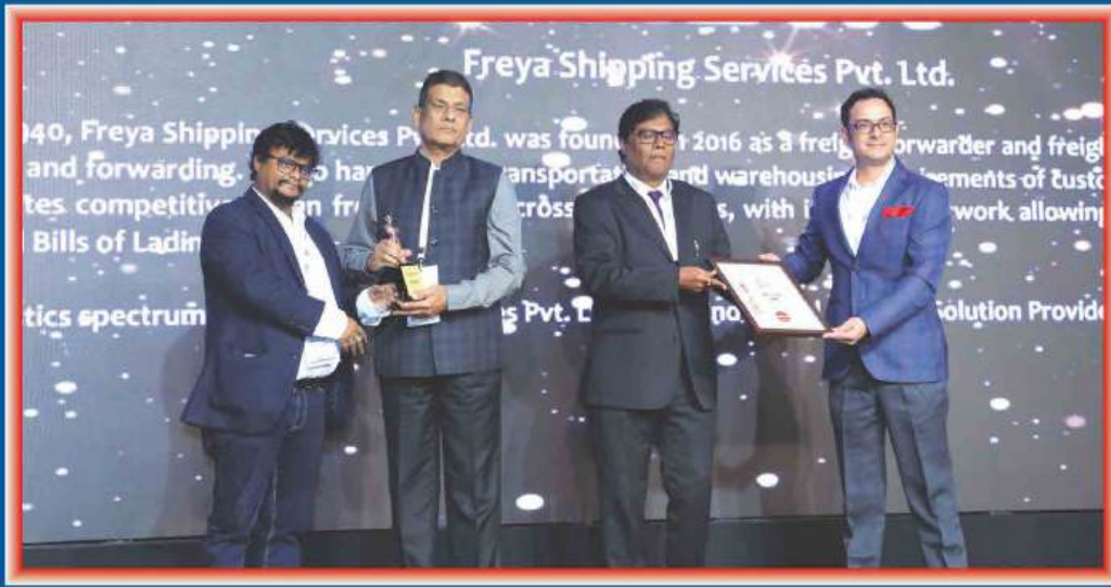
FREYA SHIPPING SERVICES PVT. LTD.