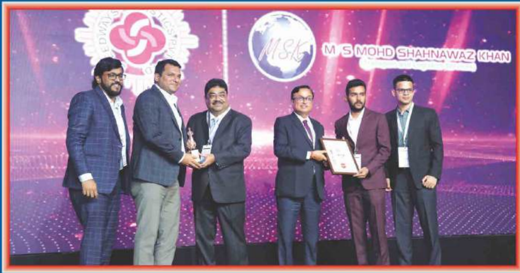
SPEEDWAYS LOGISTICS PVT. LTD.