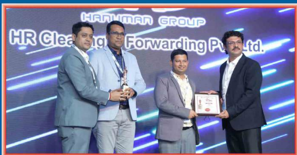
HR CLEARING & FORWARDING PVT. LTD.