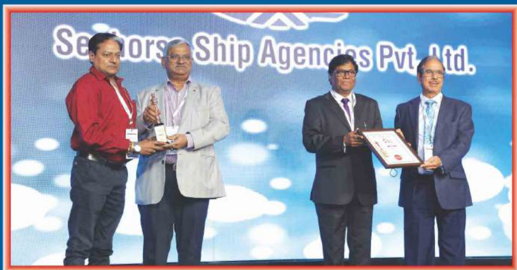
SEAHORSE SHIP AGENCIES PVT. LTD.