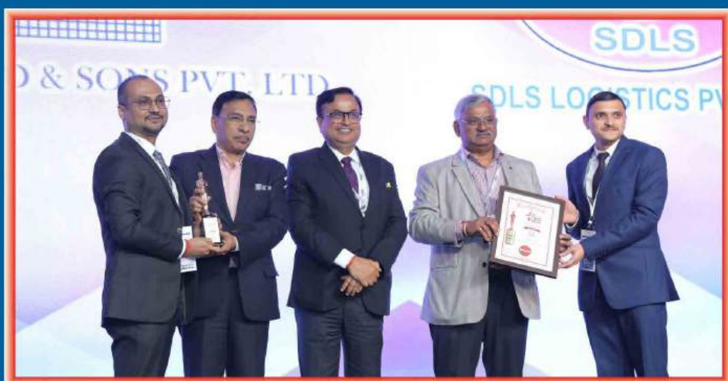
(On basis of Volume) - P. D. PRASAD & SONS PVT. LTD.