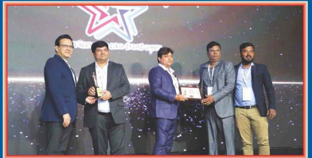
STAR CONTAINER SERVICES