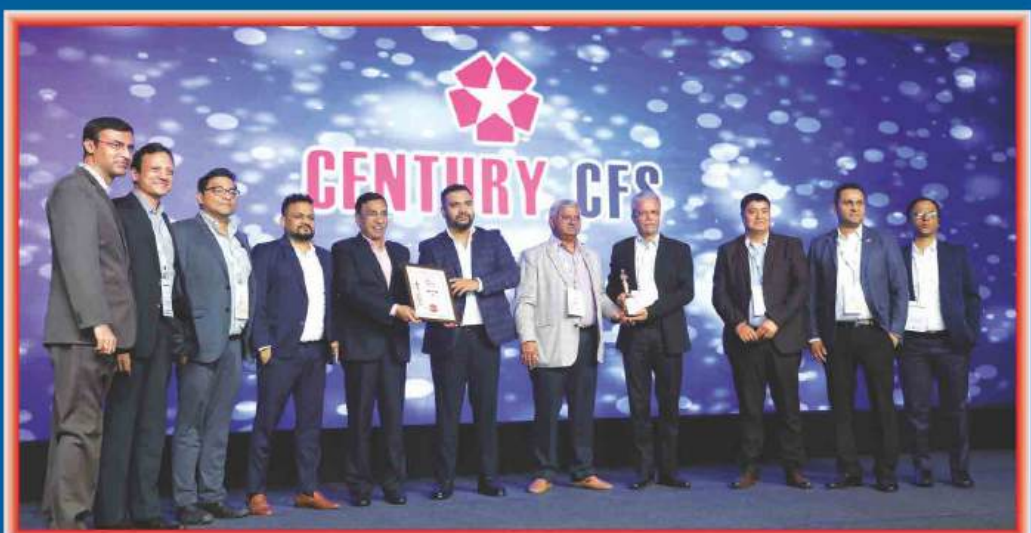
CENTURY PLYBOARDS (I) LTD. – CFS DIVISION