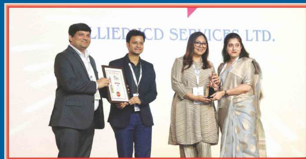
ALLIED ICD SERVICES LTD.