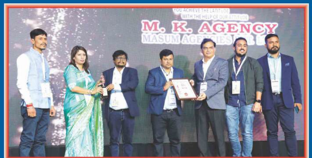
M. K. AGENCY