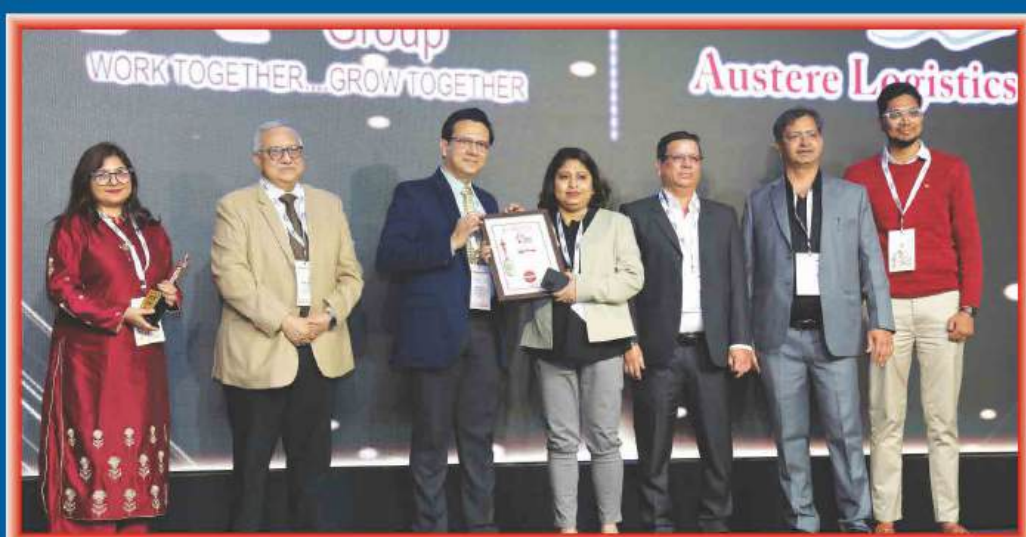
(On basis of Growth) - AUSTERE LOGISTICS PVT. LTD.