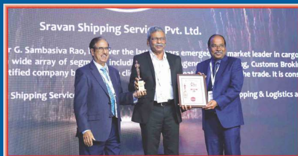
SRAVAN SHIPPING SERVICES PVT. LTD.