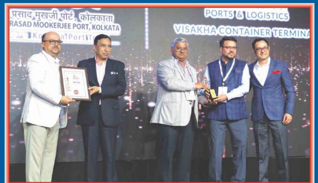
VISAKHA CONTAINER TERMINAL PVT. LTD.