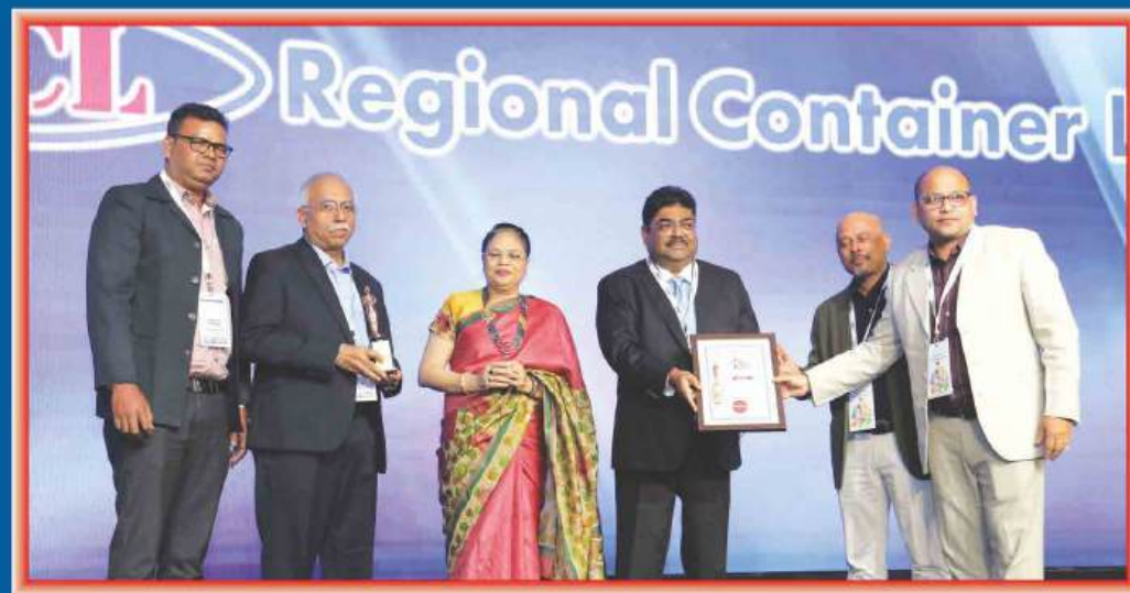
REGIONAL CONTAINER LINES